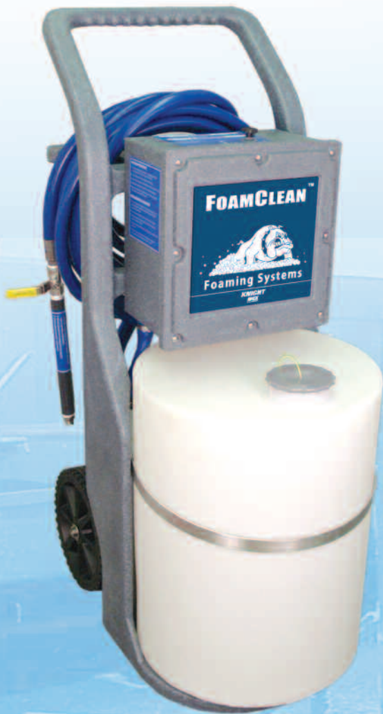
FoamClean Mobile Foamer 57 liter (15 gallon)