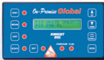
Laundry Formula Remote Control