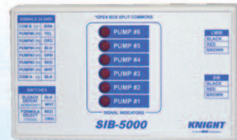
SIB Washer Interface Module