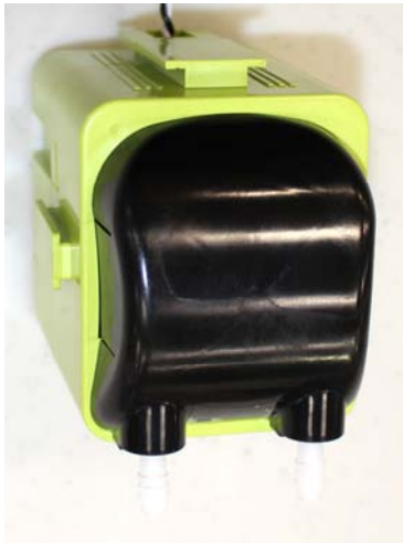
Peristaltic Pump Module

The OP Hospitality operates with a new, compact, modular pump module. Each pump module is individually encased and consists of two main parts: the motor housing and the snap off roller block. This design simplifies servicing and reduces inventory sku's. Replacing wear parts can be done in seconds without the need for tools.