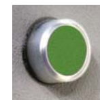
Case Mounted Manual Start Button P/N 1900452

Note: All models include suction and discharge fittings (barb type), gear clamps, suction stand pipe and 6 ft. (1.8 meter) power cord.