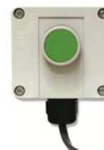
Single Product Remote Activator P/N 7640616-25

Pump activators are available for all PMP Plus models